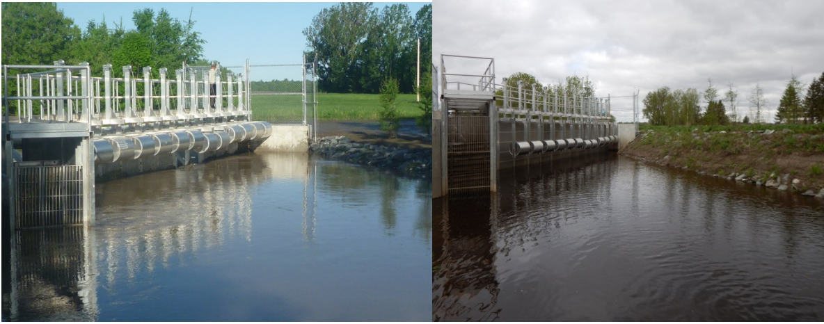
Figure 6. – Height of the float barrels during the 2014 season (on the left). Height of the barrels after installing the barrel extensions to lower the barrels prior to the 2015 trapping season (on the right).