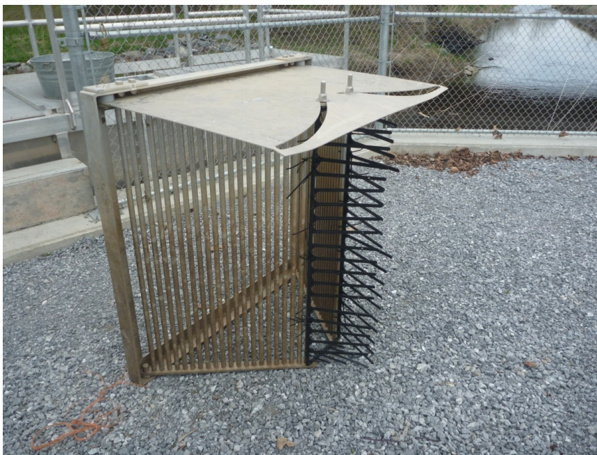
Figure 8.- The V-trap with trigger entrances (in black) attached to retain larger fish that enter the first stage of the trap were added prior to the 2015 trapping season.

The first stage of the trap, or the V-Trap section, is designed to capture and retain larger fish looking to migrate upstream, while smaller fish and lamprey are able to pass through the four cones and into the second stage of the trap. During the 2014 season, we adjusted the bar racks in the entrance to the V-Trap to a width of 254 - 305mm. For the entire season, we captured only two Snapping Turtles and one White Sucker that had become stuck in the corner of the V-Trap. Prior to the 2015 we installed trigger entrances that create a one-way entrance (Figure 8). By installing the trigger entrances, we hoped to better facilitate upstream passage of larger fish and other non-target species that encounter the barrier by ensuring they stayed in the V Trap once they entered. During the 2015 trapping season, we captured only 7 non-targets in the first stage of the two stage trap including one large snapping turtle. We found that if something large entered through the V-trap the trigger fingers would often push open and remain open allowing fish or other non-target species to exit. We hope to find a better way to attach the trigger entrance to the V-trap so that they will spring back and prevent non-targets from exiting through the V-trap entrance.