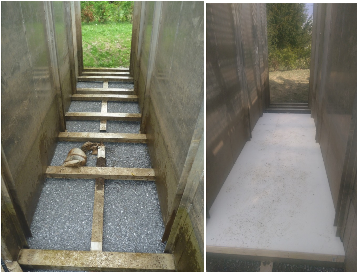
Figure 4. A view of the bottom of the two stage trap on Morpion Stream (in these pictures the diving wall and funnels that separate the first and second stages of the trap have been removed). The picture on the left shows the bottom of the trap during the 2014 season. The picture on the right shows the new floor that was installed prior to the 2015 trapping season to prevent lamprey and non-target fish from escaping, and to facilitate easier removal when checking the trap.

The catch was dominated by Fallfish (n=735; 31.7%), Common shiners (n=679; 26.8%), Rock bass (n=370; 14.6%), and White suckers (n=160; 6.3%) which combined, made up over 77% of the non-targets captured.