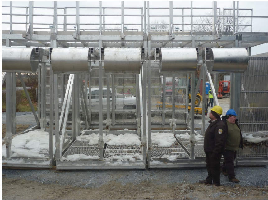
Figure 1. A picture of the barrel floats on the Morpion sea lamprey barrier. The modules are shown here during storage, and are shown with the grates in the down position, as they would be if the barrels were to float during a high water event and allow the grates to fall to the streambed.