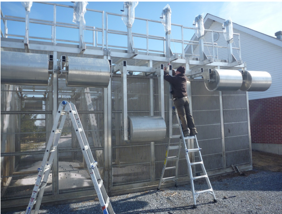
Figure 5. – New barrel extensions were added prior to the 2015 trapping season to lower the elevation of the barrels approximately 3 feet (1 meter) to allow the grates to drop before the water reached bankfull height.

During the 2015 trapping season, we had a number of high water events in June, and the barrels functioned as designed by tripping and allowing the grates to drop to the streambed before the water elevation reaches bankfull and spills into the neighboring field. During a flood event on June 9th the Pike River (no gage available on Morpion stream) rose from 15cms to over 120cms. Water from the Pike flooded its banks, and a portion of the park near the mouth of Morpion stream was flooded. During this flood event all 12 barrels tripped and the grates were lowered to the stream bed as designed.