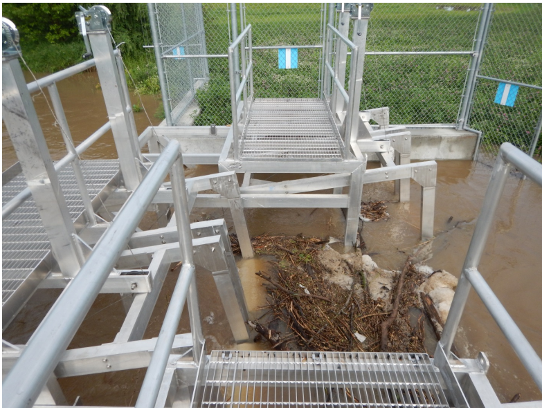
Figure 7. – In this picture module #2 (second from the river right) of the Morpion barrier had been pushed back approximately 6 feet (2 meters) during a high water event in early June of 2015.

The barrier is made up of 6 modules, each having 2 grates and corresponding barrel floats. These 6 modules line up flush with each other and form the wall of the barrier. Each module is held in place by a steel rail in the concrete apron at the upstream end, and by a C channel groove that the module sits in on the downstream side. The downstream C channel is approximately 4 inches (100mm) deep. During the installation in the spring of 2015 we noticed that some of the modules were sitting up a little higher on the downstream end, likely because sand or debris was in the C channel. We thought that if the modules were sitting in the channel 2 – 3 inches (50mm – 75mm), that it would be enough to prevent downstream movement of the modules. While the modules stayed in place under low to moderate flows, this was not the case during high flow events (Figure 7.). Four times during the beginning of June we experienced rain and high flows that pushed one or more of the modules downstream on the concrete apron. Each time, when flows receded we would manually move the modules back into place, but could never get the modules to sit completely into the C channel. In the future we now know that the C channel needs to be completely cleaned out to prevent any downstream movement of the modules.